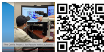
CTV Your Morning